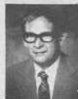
Dr. John Hospers