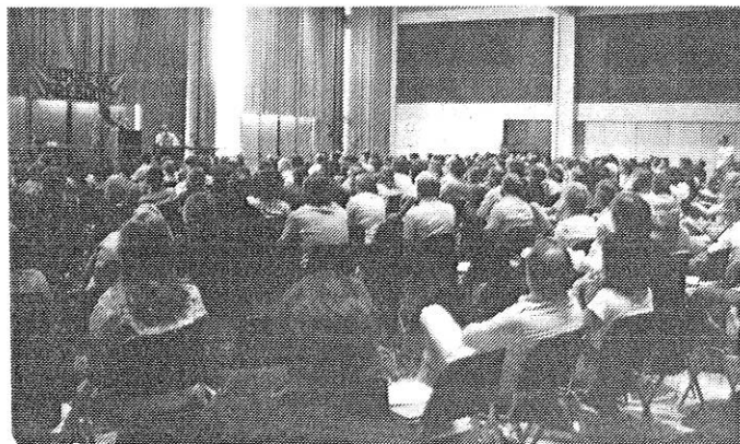
Future of Freedom Conf. at Cal State Univ., Long Beach

Anyone may attend this party; bring a friend or two (no charge at door).